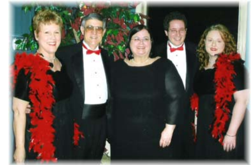
Kimbrough Singers of BRTC